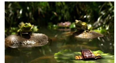
Lotte 'Coffy Bite', Rediffusion Y&R.