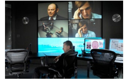
Ascent Media, Image Courtesy of FOX.

Autodesk is a leader in 3D design software, and Smoke is no exception. At the heart of Smoke is Action, a true 3D compositing environment that lets you combine unlimited layers of multi-format media, lights, 3D objects like 3D text and geometry - and a 3D camera system. Break out of your 2D workflow with Smoke – the integrated 3D compositing and non-linear editorial finishing solution.